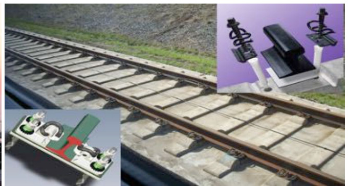
Railway fasteners across Europe