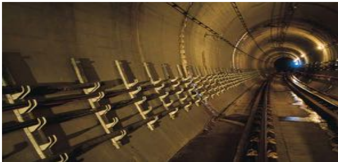
Channel tunnel and Hong Kong tunnel – steel hardware