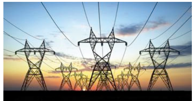
Pole line hardware across the US as well as transmission line hardware is now being protected with ArmorGalv ®