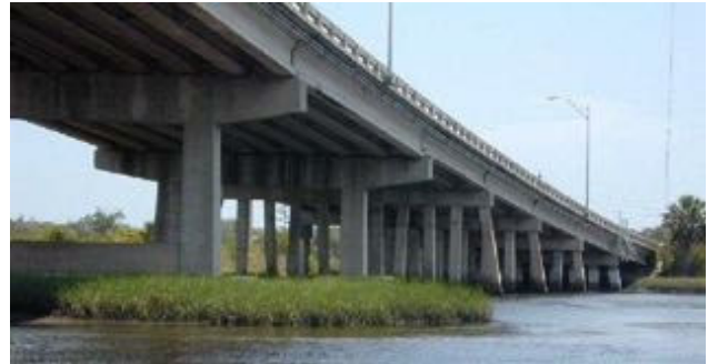
San Pablo River bridge Jacksonville Fl. – steel hardware