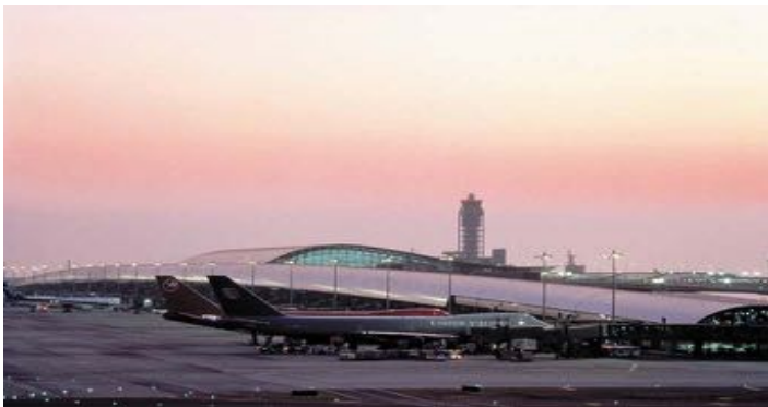
Kansai airport – roof support joints

Environment-friendly thermal Diffusion Galvanizing