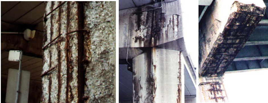
Typical corrosion of bridges and overpasses.

In recent years, rebar corrosion has proven to be a serious issue in many projects, particularly in infrastructure, such as bridges and highway overpasses. Just the issue of Highway overpasses is costing Billions of Dollars per year in maintenance, repair and replacement.