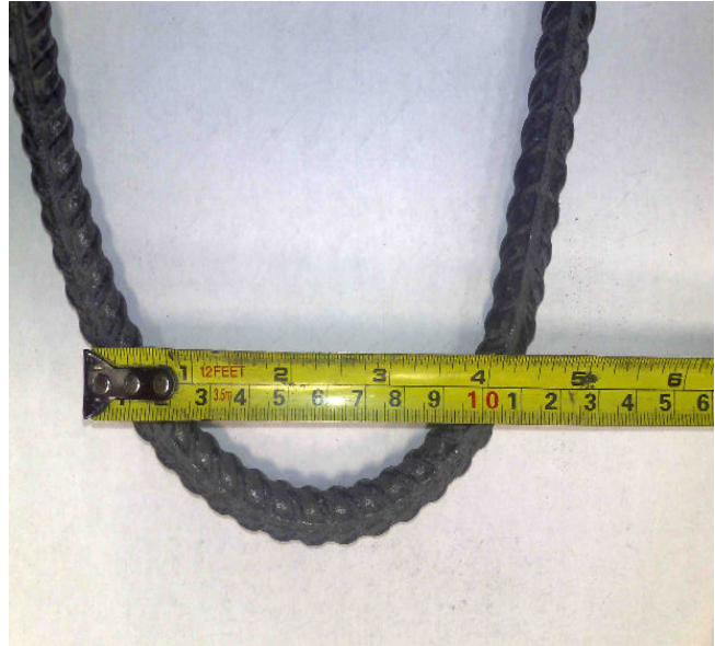
Bent rebar, coated with ArmorGalv® - No flaking or peeling.